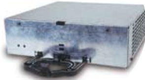
3 kVA power or charger module (one per slot)