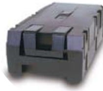
Battery module (two per slot)