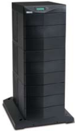
9170+ 9-slot configuration